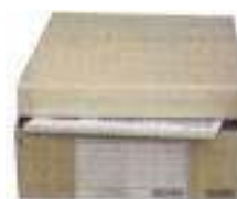
#SB1294 (#SB14104 not shown) Filing Boxes Includes LID