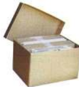
# SB15111 Archive box with lid