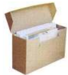
# SB15510 Hinged lid Filing Box